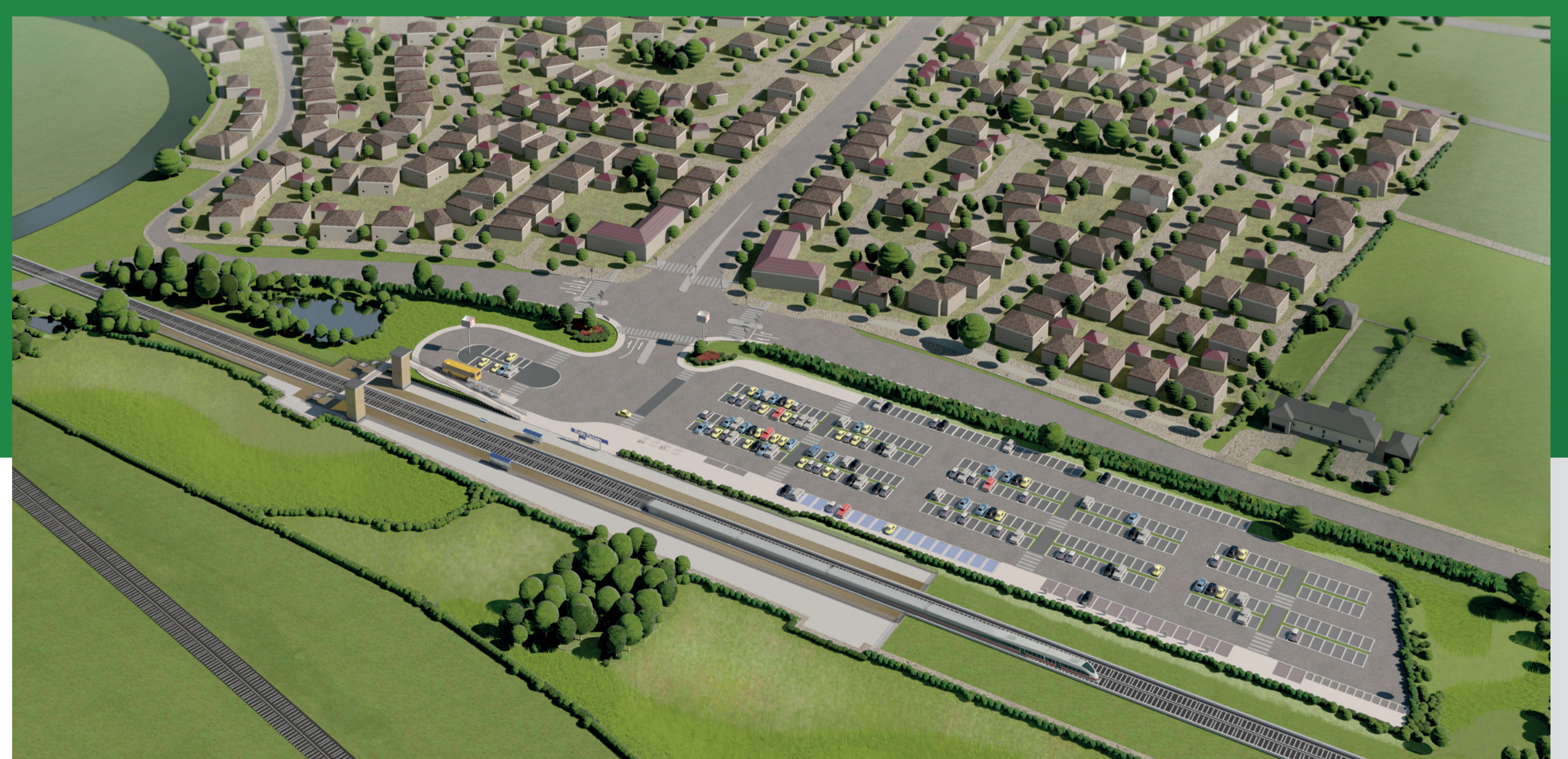
Artist's Impression Rugby Parkway Station

Rugby Parkway Station represents a significant element in the transformation of Warwickshire's public transport provision.