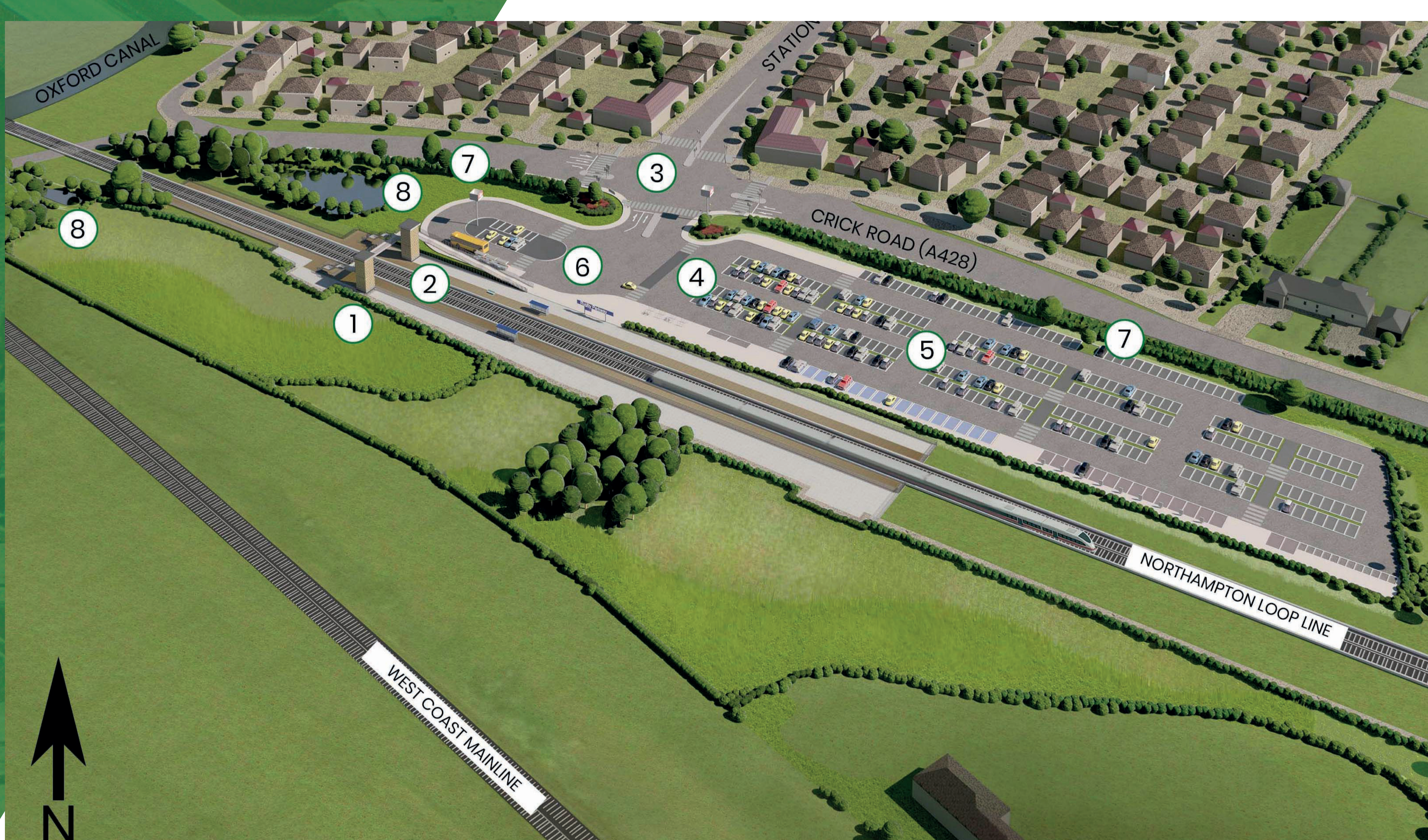
Illustrative Site Plan